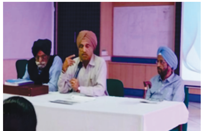
Chairman RSCWS addressing the ECM with the President & Secretary General sitting besides him