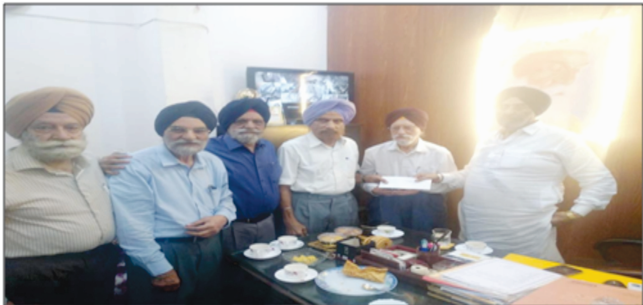
Officials of RSCWS Presenting a donation cheque of Rs. 21000/- from RSCWS Social Welfare Fund, to Chairman & Gen. Secretary of Tera-Hi-Tera group of Philanthropic Hospitals, Sector 45, 18 & 26, Chandigarh