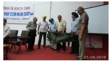
RSCWS presents two Folding Stretchers to Railway Station Chandigarh for Accidental Cases