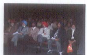
Audience at RSCWS AGM