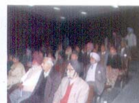
Audience at RSCWS AGM