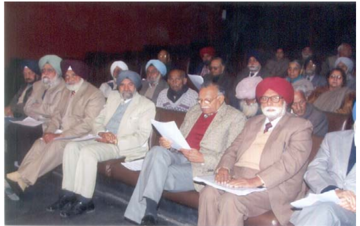
A view of the audience at RSCWS - AGM