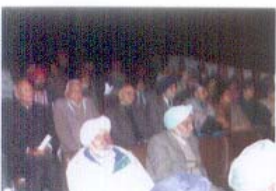
Audience at RSCWS AGM